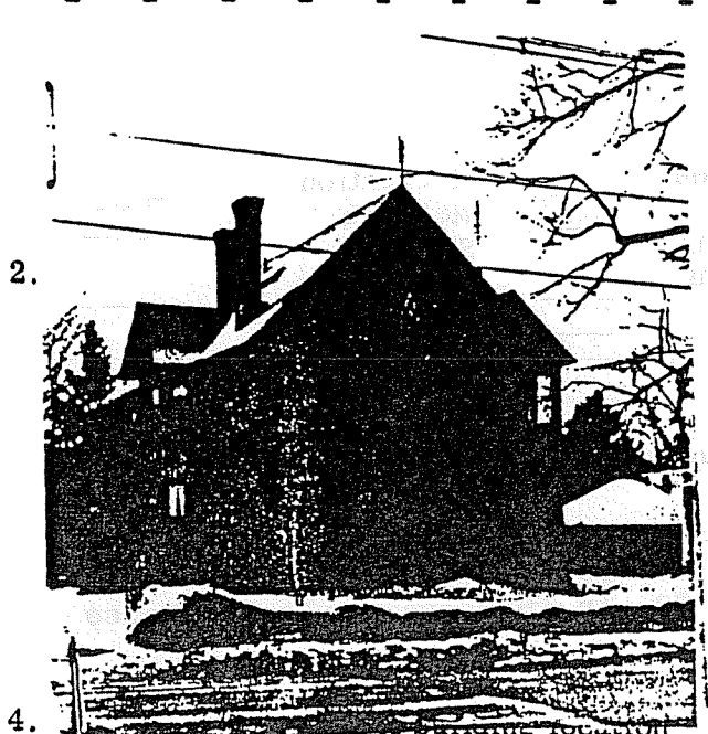
4. Building location in relation to nearest cross streets and other buildings. Indicate north.